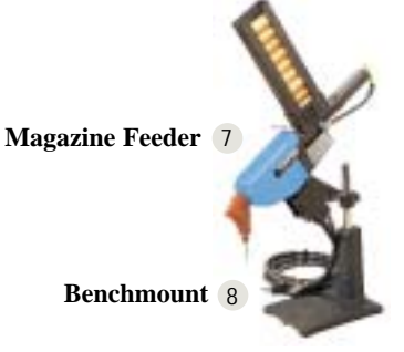
7 Magazine Feeder 8 Benchmount