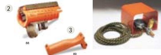
2 3 4 Foot Pedal

1 A general purpose tip (.090) is supplied with each Polygun. To increase productivity, optional tips can provide multiple beads, flat ribbons, guided beads for carton sealing, and extended reach.